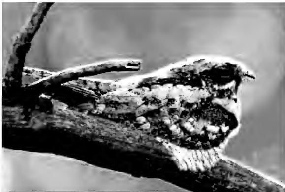
Indian Little Nightjar Caprimulgus asiaticus

The bird runs about actively probing in loose soil with bill partly open like forceps; while doing this crest is furred to a point projecting behind, making the bird's head look like a pickaxe.